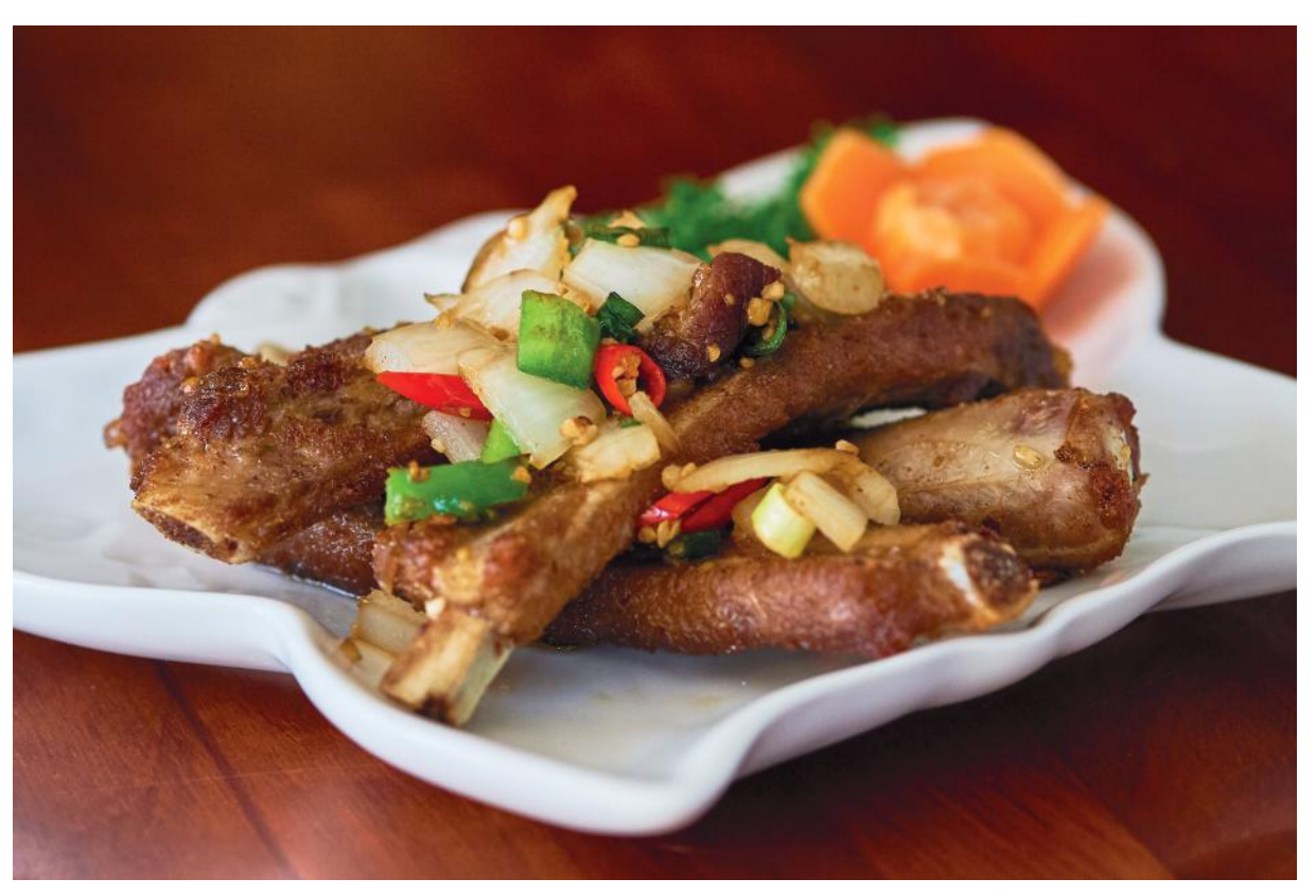
PLEASE INFORM YOUR SERVER OF ANY ALLERGIES BEFORE PLACING YOUR ORDER. A 10% SERVICE CHARGE WILL BE ADDED TO THE BILL FOR PARTIES OF SIX PEOPLE OR MORE.