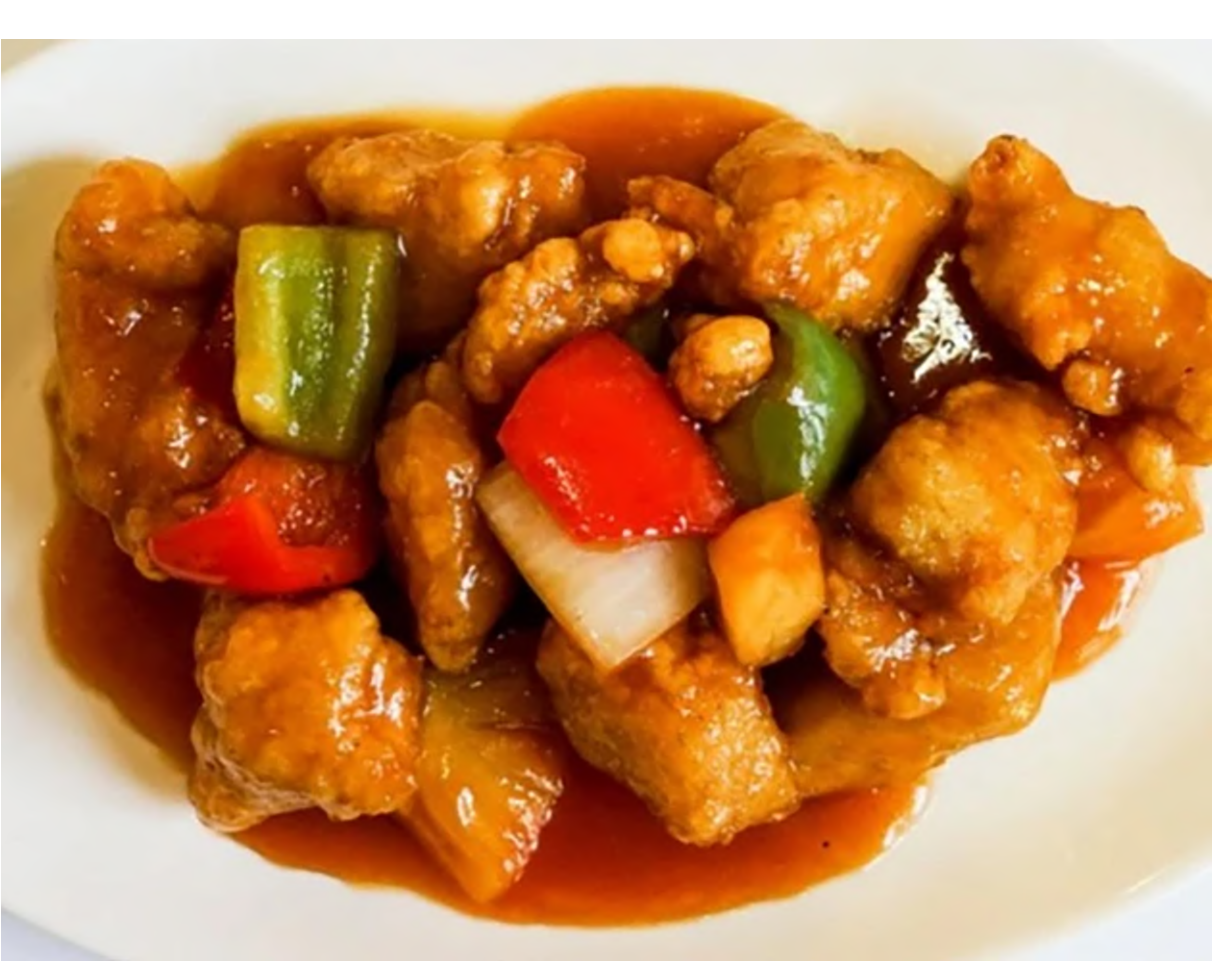
PLEASE INFORM YOUR SERVER OF ANY ALLERGIES BEFORE PLACING YOUR ORDER. A 10% SERVICE CHARGE WILL BE ADDED TO THE BILL FOR PARTIES OF SIX PEOPLE OR MORE.