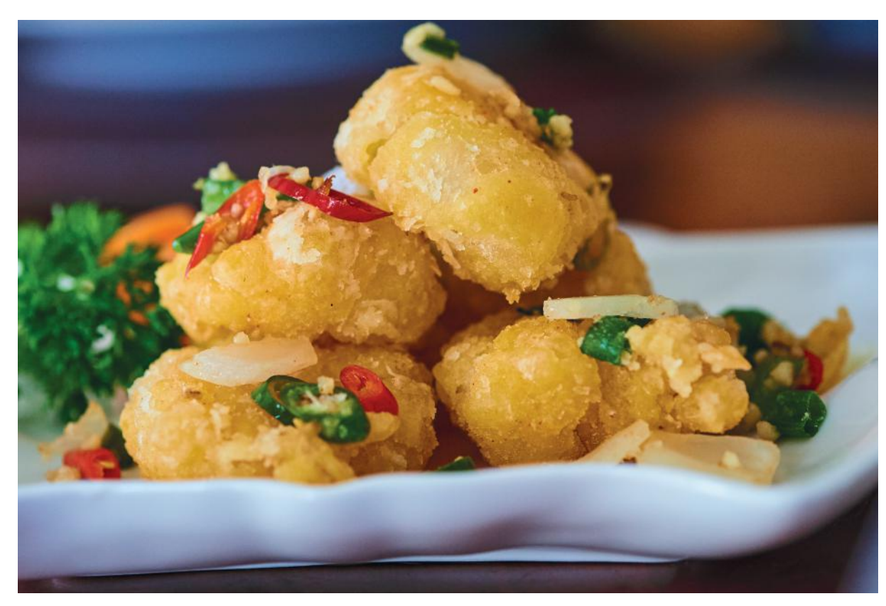
PLEASE INFORM YOUR SERVER OF ANY ALLERGIES BEFORE PLACING YOUR ORDER. A 10% SERVICE CHARGE WILL BE ADDED TO THE BILL FOR PARTIES OF SIX PEOPLE OR MORE.