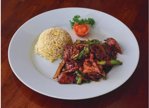
PLEASE INFORM YOUR SERVER OF ANY ALLERGIES BEFORE PLACING YOUR ORDER. A 10% SERVICE CHARGE WILL BE ADDED TO THE BILL FOR PARTIES OF SIX PEOPLE OR MORE.