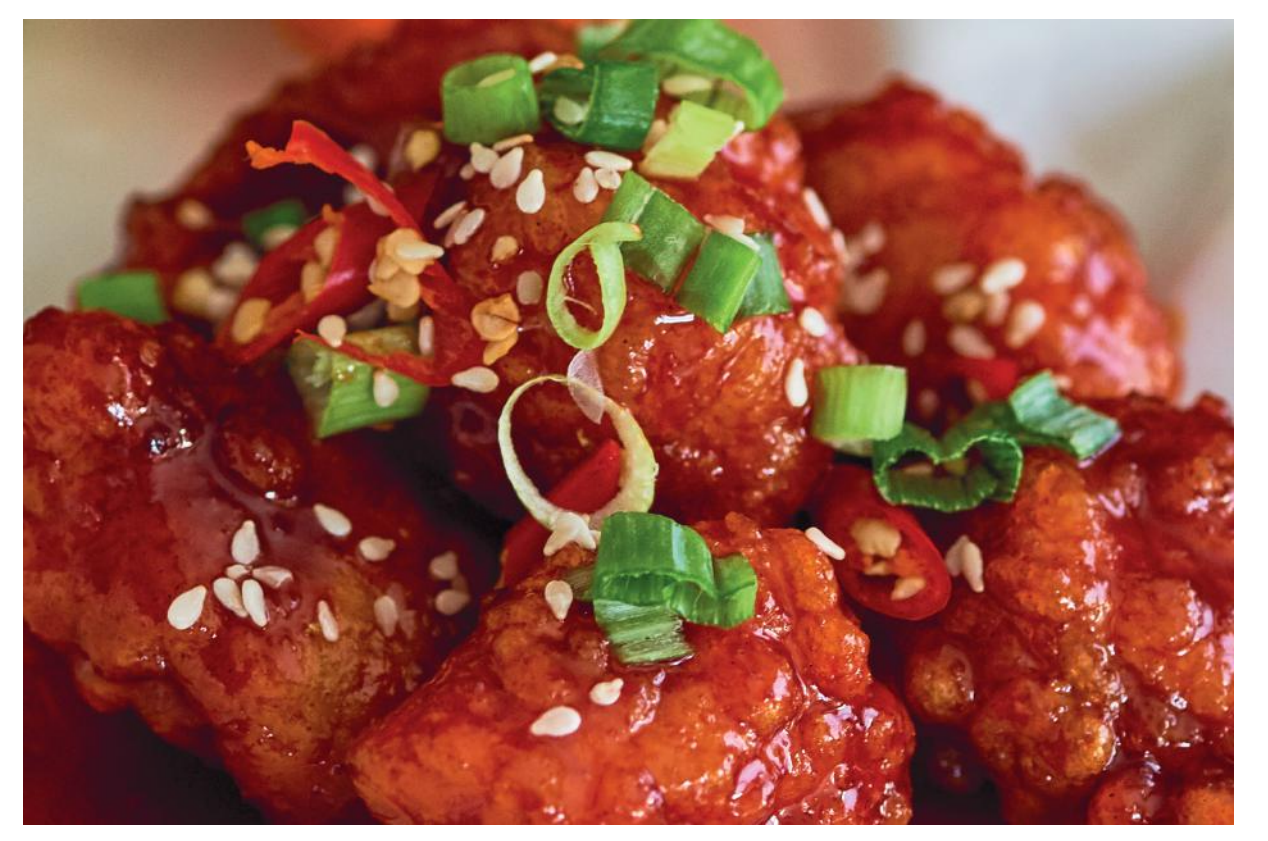
PLEASE INFORM YOUR SERVER OF ANY ALLERGIES BEFORE PLACING YOUR ORDER. A 10% SERVICE CHARGE WILL BE ADDED TO THE BILL FOR PARTIES OF SIX PEOPLE OR MORE.